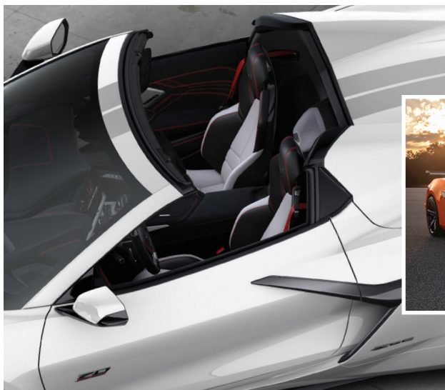
70th Anniversary Edition

Z06 owners can take their driving experience to the next level with a couple of option packages. The Z07 Performance Package offers standard carbon ceramic brakes and Michelin Pilot Sport Cup 2 tires (summer-only),* and owners can opt for available carbon-fiber wheels for unsprung weight savings of 41 pounds. Corvette's 70th Anniversary Edition is also available on the Z06, complete with unique Ceramic White Leather and red stitching, Red Stripe wheels and 70th Anniversary badging throughout the vehicle.