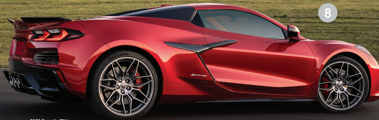
2023 Corvette Z06

© 2022 General Motors. All rights reserved. GM, the GM logo, GM Genuine Parts, ACDELco, Chevrolet, GMC, Buick, Cadillac and the slogans, emblems, vehicle model names, vehicle body designs and other marks appearing in this publication are the trademarks and/or service marks of General Motors, its subsidiaries, affiliates or licensors. All information in the publication is based on the latest information at the time of publication approval. The right is reserved to make changes at any time in prices, rebates or offers. Service Insights magazine, General Motors, participating dealers and the publisher of this magazine are not responsible for prices or information printed in error.