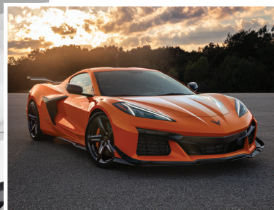
Z07 Performance Package

* Do not use summer-only tires in winter conditions, as it would adversely affect vehicle safety, performance and durability. Use only GM-approved tire and wheel combinations. Unapproved combinations may change the vehicle's performance characteristics. For important tire and wheel information, go to your Owner's Manual or see your dealer.