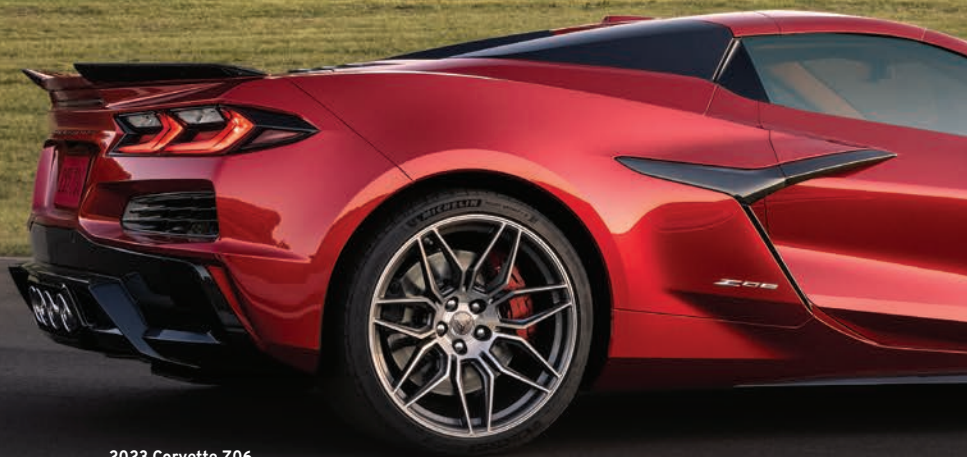
2023 Corvette Z06

12 GM GENUINE PARTS OE components work to steer customers straight