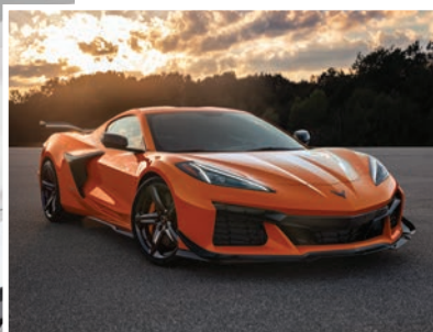
Z07 Performance Package